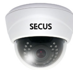
HIP-HD330VIR ▶ Indoor/30IR