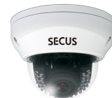
HIP-HV332VIR ▶ Vandal/32IR