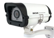
HIP-HH384VIR ▶ Housing/84IR