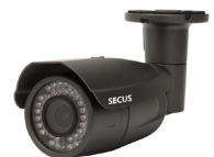
HIP-HP342VIR ▶ Bullet/42IR