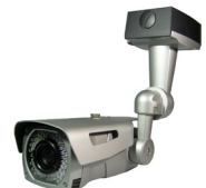
HIP-AP3VIRH ▶ Bullet/70IR