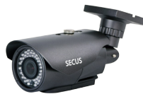
HIP-HP360EVIR ▶ Bullet/60IR